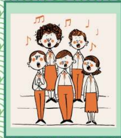
Illustration by Denis Angello

Whether you think you can sing... or not!... Come and see what role you can play in the beautification of our communal prayer. Instrumentalists also welcome!