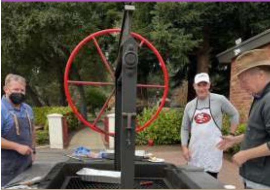
Legion of Mary