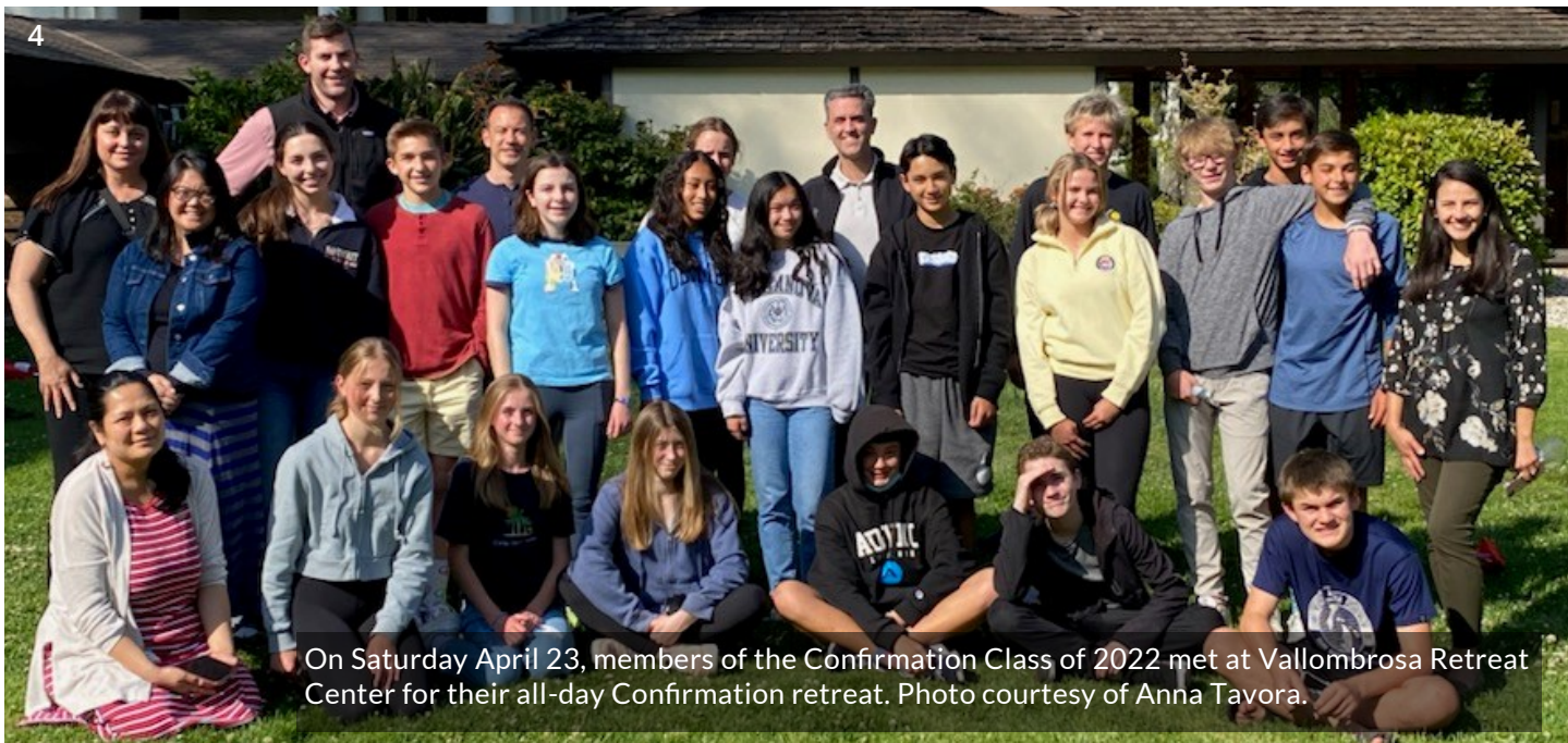
On Saturday April 23, members of the Confirmation Class of 2022 met at Vallombrosa Retreat Center for their all-day Confirmation retreat.