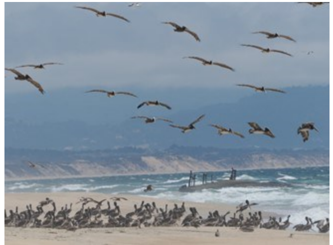
Pelicans now abound on the shores of Monterey Bay.

Listed as endangered in 1970, the species rebounded after the DDT ban, enough to be removed from the endangered species list in 2009. Still, oil spills threaten the waterproofing of their feathers, and plastic refuse in the oceans causes a major threat of starvation. Let us continue to be vigilant in our stewardship of their habitats.