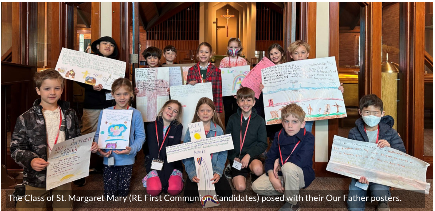
The Class of St. Margaret Mary (RE First Communion Candidates) posed with their Our Father posters.