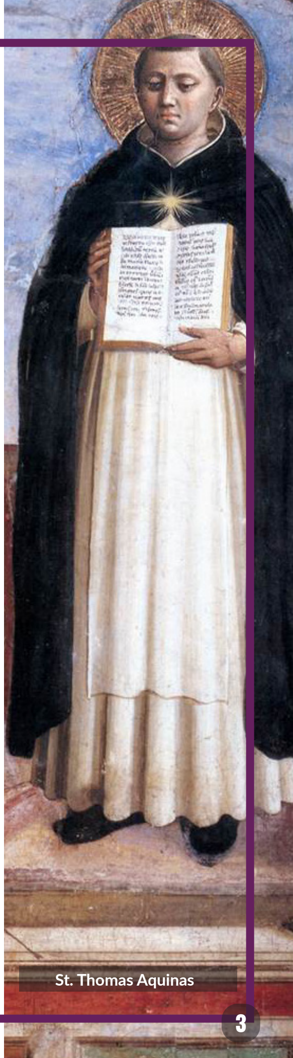
St. Thomas Aquinas

8:00 am Mass (Church) 10:00 am Mass (Church) 10:00 am Mass (Outdoors)