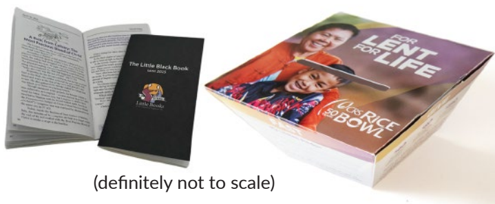
(definitely not to scale)