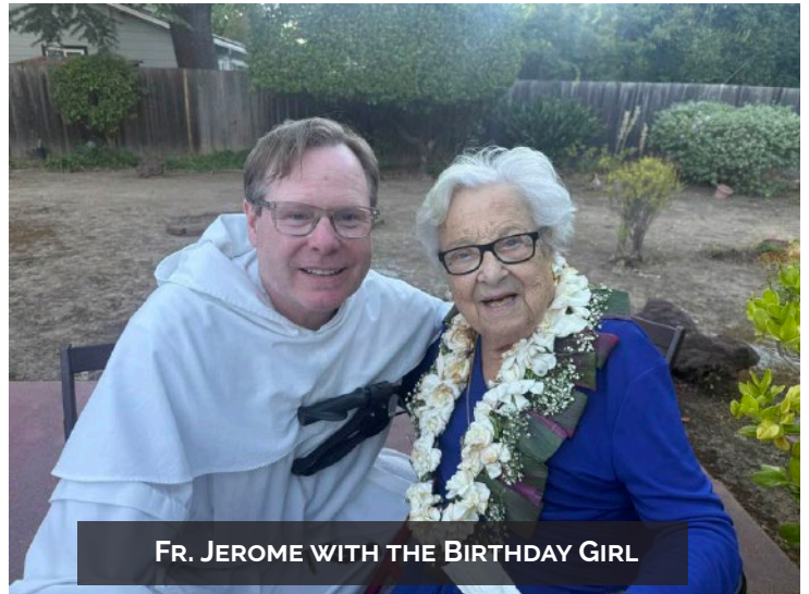
FR. JEROME WITH THE BIRTHDAY GIRL

IN THE EVENT CENTER AT SAINT MARY'S CATHEDRAL 1111 GOUGH STREET, SAN FRANCISCO, CA, 94109 TUESDAYS THROUGH SUNDAYS JUNE 21 TO SEPTEMBER 14 TICKETS at: chapelsistine.com/exhibits/san-francisco